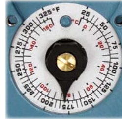
Set-point dial protected within a NEMA 7 & 9 enclosure

Class I Division 1 & 2 Group B, C, D Class II Division 2 Group E, F, G Class III