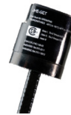
JHE-GET Low-Profile End Seal Kit