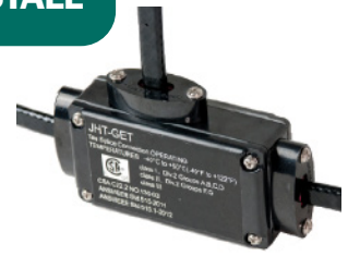
JHT-GET Low-Profile Tee Connection Kit