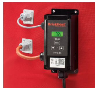
Easy-to-program digital controller