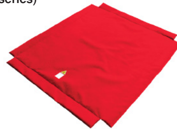
Optional Insulating Cover