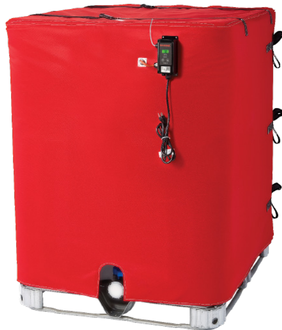
All-in-one heater with plug-and-play solution

Image above shown with optional top cover (sold separately)