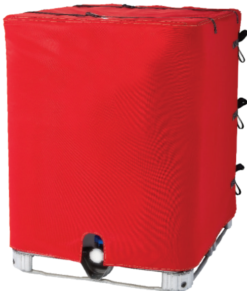
Insulator — Pairs nicely with BriskHeat® Tote Tank/IBC Immersion Heater. See page 139 for details.

Image above shown with optional top cover (sold separately)