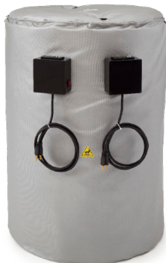
Dual-Zone Model — Quickly melt viscous materials like molasses, syrups, etc.