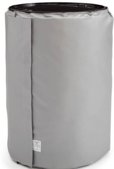
Insulator Only Model — Pairs nicely with BriskHeat® silicone rubber or immersion drum heaters