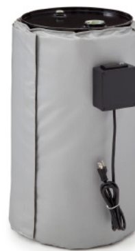
16 gal (61 l)