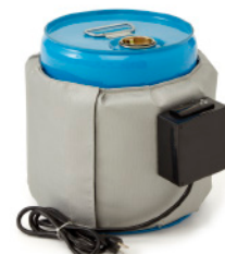
5 gal (19 l)

Custom Sizes and Designs Available: Contact BriskHeat® or your local distributor for more information.