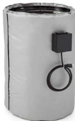
30 gal (114 l)