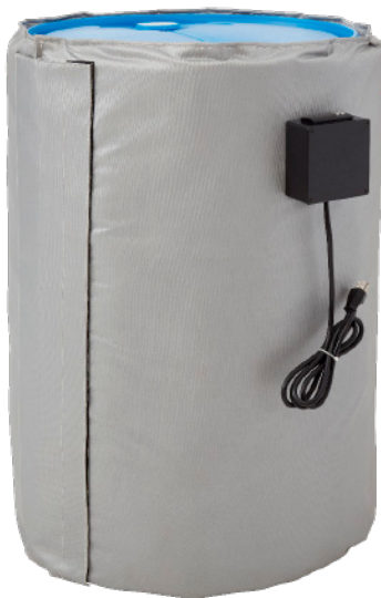
Single-Zone Model — Good general-purpose choice