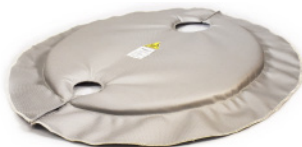
FGDC55V Drum Covers — Helps reduce heat loss and speed up heat-up time