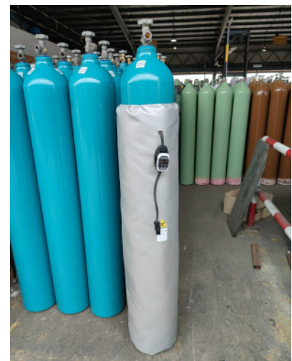
Custom Gas Cylinder Heater with LYNX® controls

Custom Sizes and Designs Available: Contact BriskHeat® or your local distributor for more information.