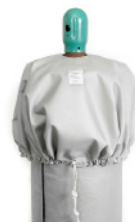
Gauge/ Valve Cover

Cylinder Base Insulation Pad - Placed between cylinder and floor. Further insulates the cylinder from heatsinks such as a concrete floor.