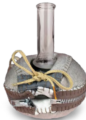
Spherical Heating Mantle page 185