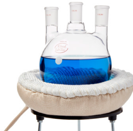
Lower Hemispherical Heating Mantle page 184