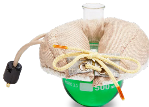
Upper Hemispherical Heating Mantle page 185