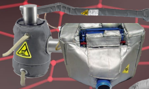
Cloth Heating Jackets