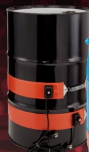
Drum and Pail Heaters