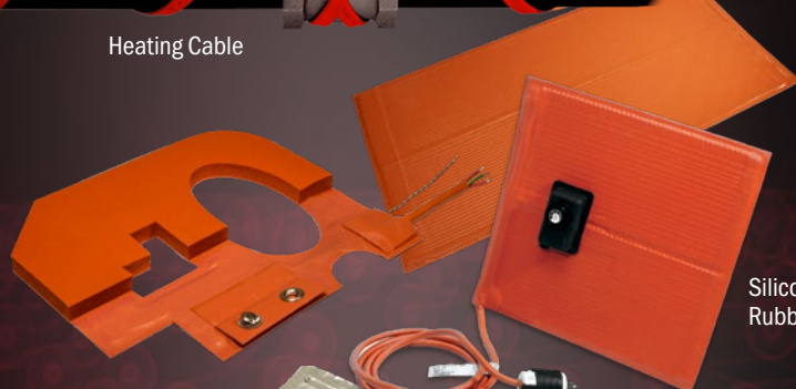
Silicone Rubber Heaters