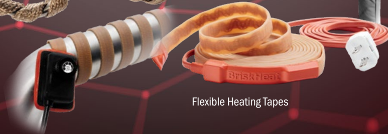
Flexible Heating Tapes