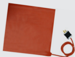
Composite Heating Blankets