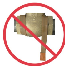
C.) Incorrect Installation: Heating tape hanging free from the surface