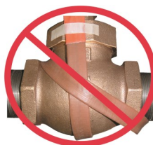
D.) Incorrect Installation: Heating tape overlapped on itself