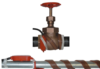
A.) Proper Installation (pipe and valve)

Plug power cord into appropriate grounded outlet.