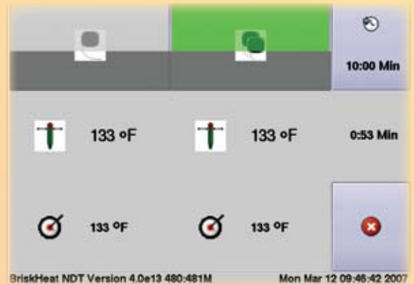
Easy One-Button Start (Actual Screenshot)