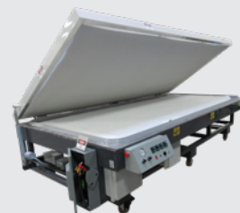
Vacuum Curing/Debulking Tables