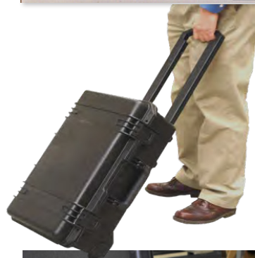
Easy to transport