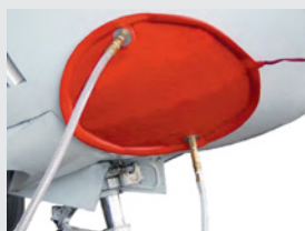
Composite Heating Blankets