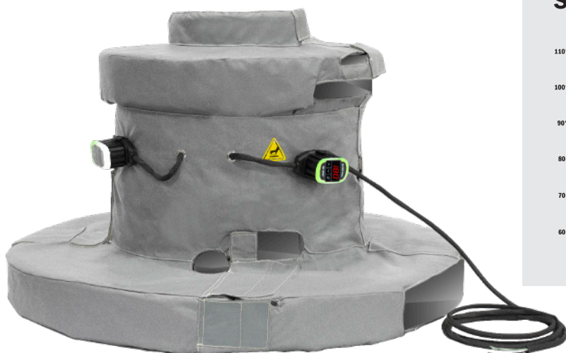
Gray PTFE Vacuum Bake-Out Heater Chamber

Other Available Options: High-limit manual reset, temperature sensor plug or receptacle, temperature indicator lights, built-in digital temperature controller, built-in LYNX®