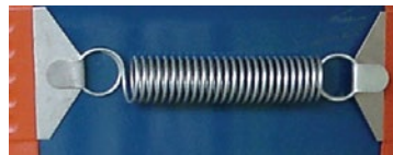
10180: Replacement Spring