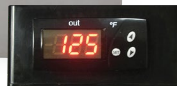
Fully Insulated With Digital Control