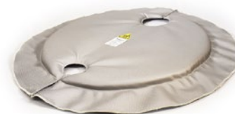
Drum Covers Help Reduce Heat Loss and Speed up Heat-up Time

If your drum diameter is greater than what is shown, an FGDHSTRIP expansion strip may be required.