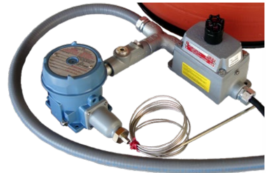
NEMA 7 Controller and High Temperature Limit Indicator Light