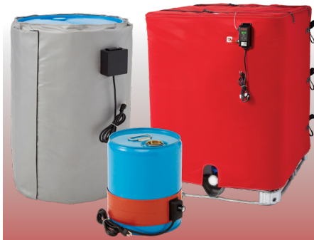
DRUM & TOTE HEATERS