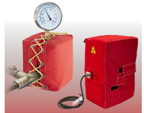
CLOTH HEATERS & INSULATORS