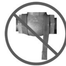
(A) Incorrect Installation: Heating tape hanging free from the surface