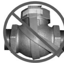
(C) Incorrect Installation: Heating tape overlapped on itself